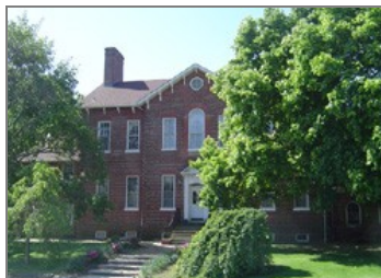
St. Thomas Manor